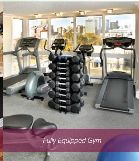
Fully Equipped Gym